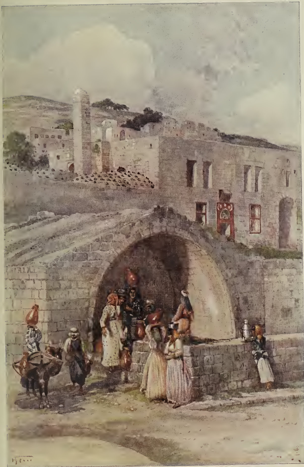
The Virgin's Fountain, Nazareth.